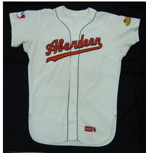
Aberdeen Pheasants photograph (1947) and jersey.